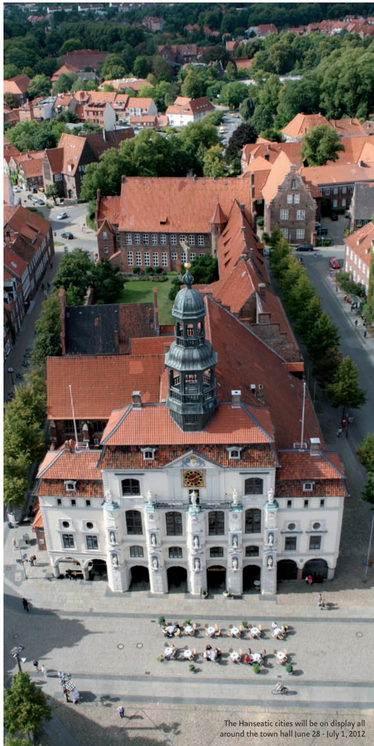
The Hanseatic cities will be on display all around the town hall June 28 - July 1, 2012