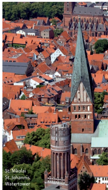
St. Nikolai St. Iohannis Watertower